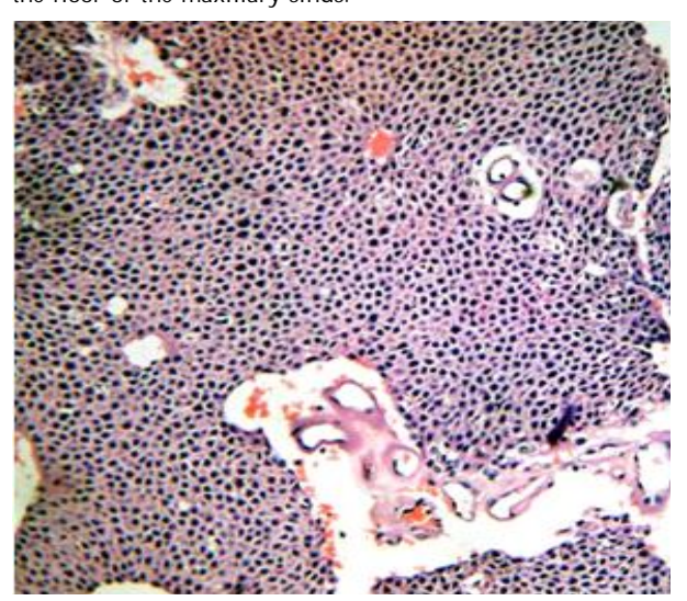
Fig. 3: Photomicrograph(10X) showing sheets of polyhedral cells