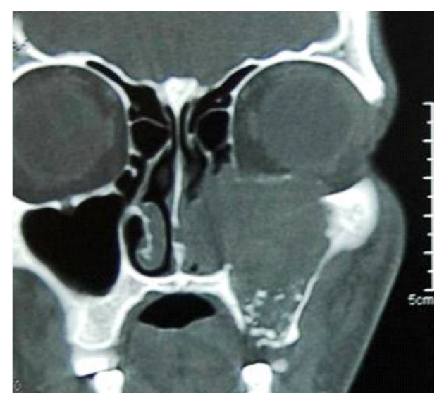
Fig. 2: CT scan showing specks of calcifications and erosion of the floor of the maxillary sinus.